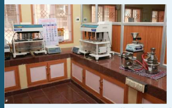
Jet Mill and Dissolution Test Apparatus