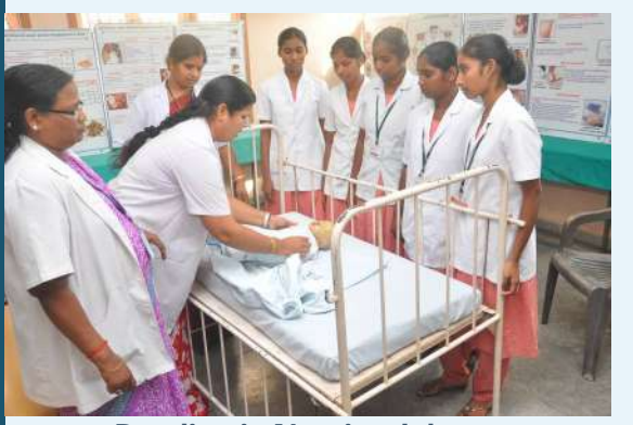
Paediatric Nursing lab